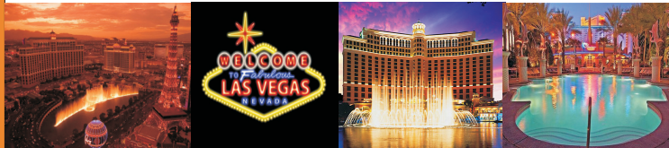
Las Vegas Strip

(*excl NAR registration, subject to change due to exchange rate)